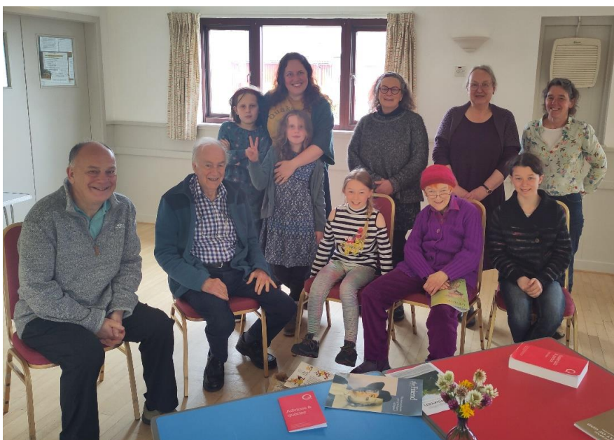
My (and my family's) visit to Shetland Local Meeting