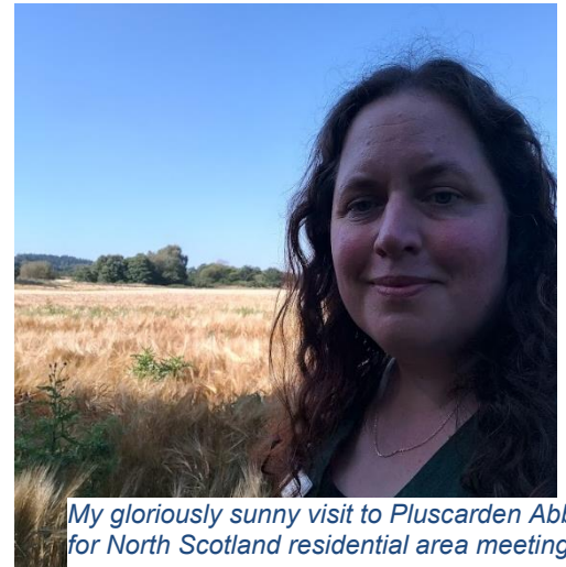
My gloriously sunny visit to Pluscarden Abbey for North Scotland residential area meeting

For the past two years Quakers in Scotland have helped me with this, by suggesting what they feel I should prioritise for the year ahead. I hope that you will do the same this year.