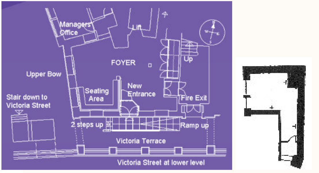
Figure 2. Foyer and Bow Room

There follows a description of each room, working down from the top.